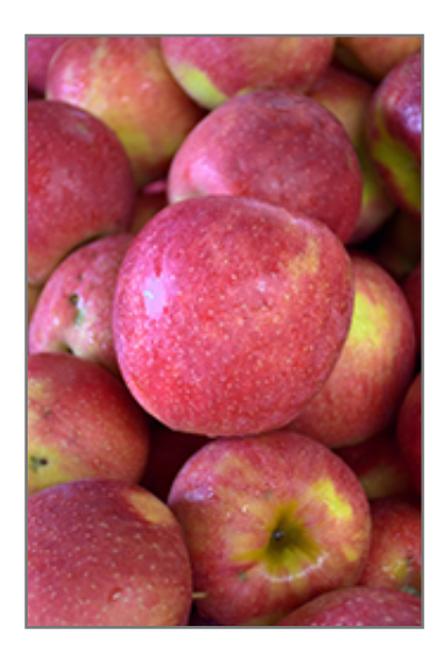
Jonagold Apple fruit

Jonagold Apple features showy clusters of lightly-scented white flowers with shell pink overtones along the branches in mid spring, which emerge from distinctive pink flower buds. It has forest green deciduous foliage. The pointy leaves turn yellow in fall. The fruits are showy yellow apples with a scarlet blush, which are carried in abundance in mid fall. The fruit can be messy if allowed to drop on the lawn or walkways, and may require occasional clean-up.