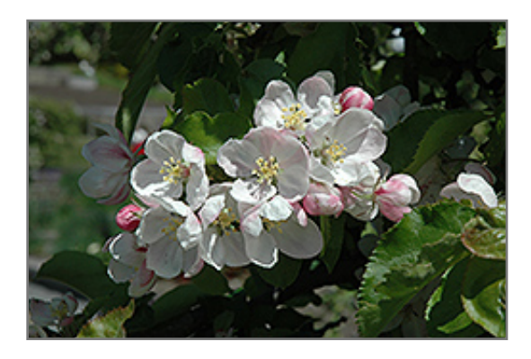
Jonagold Apple flowers