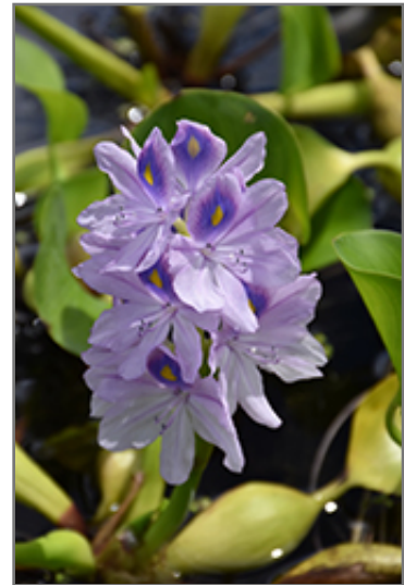
Water Hyacinth flowers