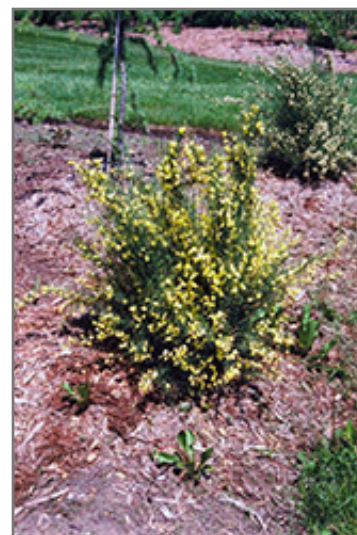
Scotch Broom in bloom