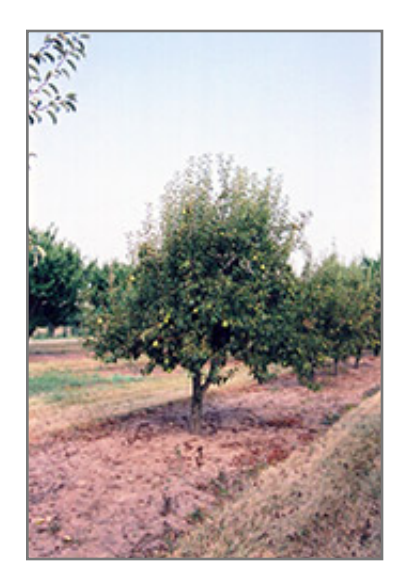
Bartlett Pear