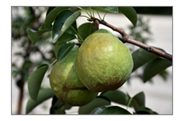
Bartlett Pear fruit