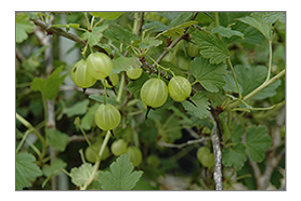
Hinnonmaki Yellow Gooseberry fruit