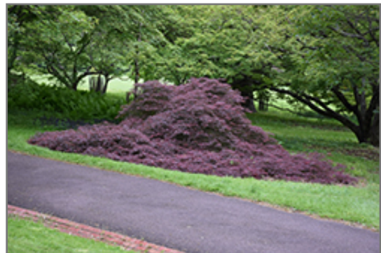
Garnet Cutleaf Japanese Maple