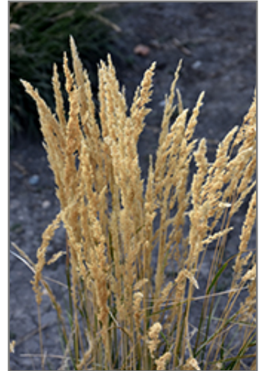
El Dorado Feather Reed Grass fruit

El Dorado Feather Reed Grass is a fine choice for the garden, but it is also a good selection for planting in outdoor pots and containers. Because of its height, it is often used as a 'thriller' in the 'spiller-thriller-filler' container combination; plant it near the center of the pot, surrounded by smaller plants and those that spill over the edges. It is even sizeable enough that it can be grown alone in a suitable container. Note that when growing plants in outdoor containers and baskets, they may require more frequent waterings than they would in the yard or garden.