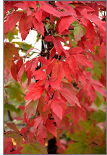
Paperbark Maple in fall

This tree does best in full sun to partial shade. It prefers to grow in average to moist conditions, and shouldn't be allowed to dry out. It is not particular as to soil type or pH. It is somewhat tolerant of urban pollution. This species is not originally from North America.