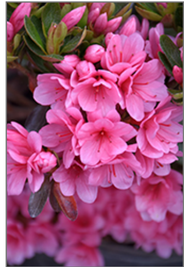
Coral Bells Azalea flowers