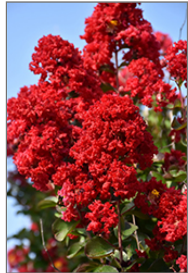
Dynamite Crapemyrtle flowers