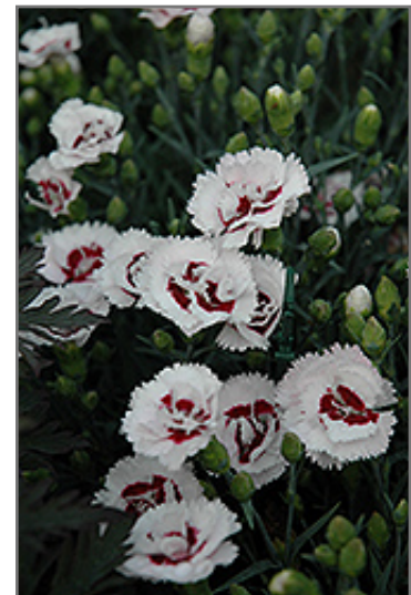
Scent First Coconut Surprise Pinks flowers