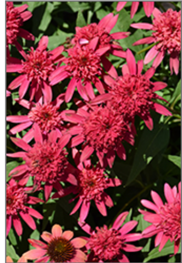
Double Scoop Raspberry Coneflower flowers