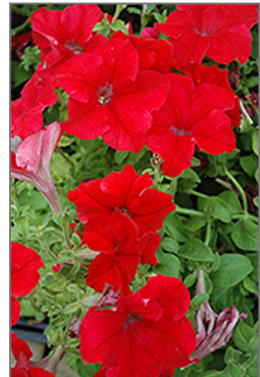
Dreams Red Petunia flowers