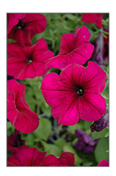
Hurrah Velvet Petunia flowers

Hurrah Velvet Petunia will grow to be about 10 inches tall at maturity, with a spread of 14 inches. When grown in masses or used as a bedding plant, individual plants should be spaced approximately 10 inches apart. Its foliage tends to remain low and dense right to the ground. This fast-growing annual will normally live for one full growing season, needing replacement the following year.