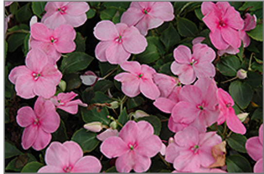
Super Elfin XP Pink Impatiens flowers