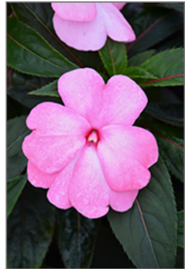
Super Sonic Pastel Pink New Guinea Impatiens flowers

Super Sonic Pastel Pink New Guinea Impatiens is recommended for the following landscape applications;