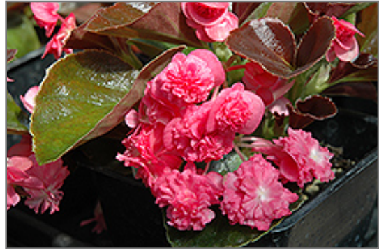
Doublet Rose Begonia flowers