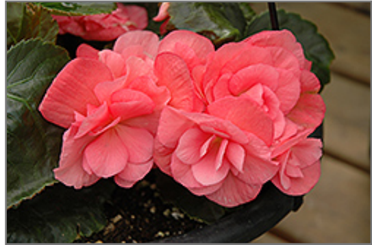
Dragone Pink Hope Begonia flowers

Dragone Pink Hope Begonia is recommended for the following landscape applications;