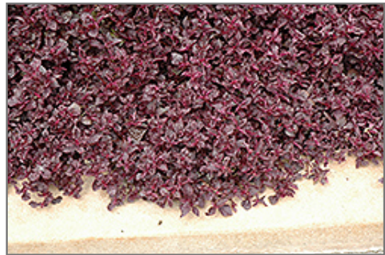
Purple Lady Blood Leaf