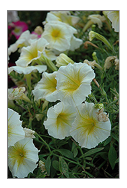
Fame Yellow Petunia flowers

Fame Yellow Petunia will grow to be about 8 inches tall at maturity, with a spread of 12 inches. When grown in masses or used as a bedding plant, individual plants should be spaced approximately 10 inches apart. Its foliage tends to remain low and dense right to the ground. This fast-growing annual will normally live for one full growing season, needing replacement the following year.