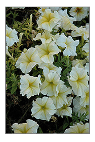
Paparazzi Glitz Yellow Petunia flowers

Paparazzi Glitz Yellow Petunia will grow to be about 12 inches tall at maturity, with a spread of 14 inches. When grown in masses or used as a bedding plant, individual plants should be spaced approximately 12 inches apart. Its foliage tends to remain dense right to the ground, not requiring facer plants in front. This fast-growing annual will normally live for one full growing season, needing replacement the following year.