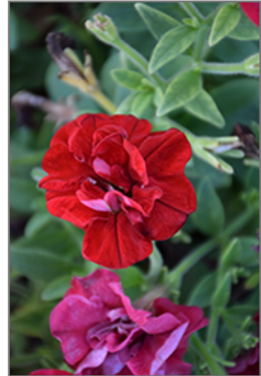
SweetSunshine Red Petunia flowers