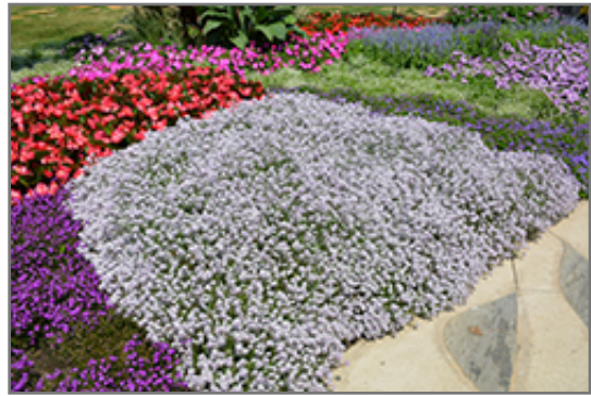
Blushing Princess Sweet Alyssum in bloom

Blushing Princess Sweet Alyssum is a fine choice for the garden, but it is also a good selection for planting in hanging baskets. Because of its trailing habit of growth, it is ideally suited for use as a 'spiller' in the 'spiller-thriller-filler' container combination; plant it near the edges where it can spill gracefully over the pot. Note that when growing plants in outdoor containers and baskets, they may require more frequent waterings than they would in the yard or garden.