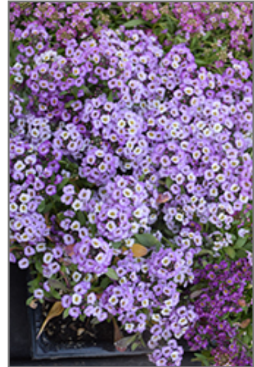
Clear Crystal Lavender Shades Sweet Alyssum flowers

Clear Crystal Lavender Shades Sweet Alyssum is recommended for the following landscape applications;