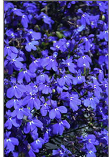
Techno Blue Lobelia flowers

Techno Blue Lobelia is recommended for the following landscape applications;