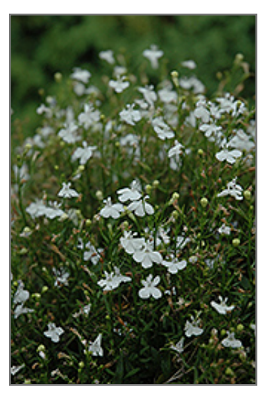
Waterfall White Sparkle Lobelia flowers