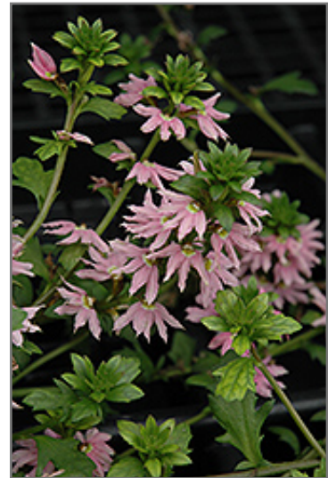
Bombay Pink Fan Flower flowers