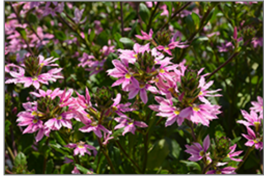
Bombay Pink Fan Flower flowers

Bombay Pink Fan Flower is recommended for the following landscape applications;