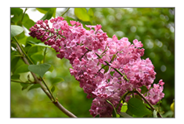
Maiden's Blush Lilac flowers

Maiden's Blush Lilac is recommended for the following landscape applications;