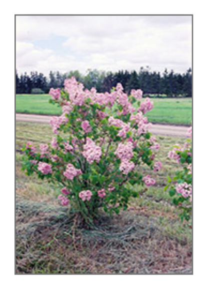
Maiden's Blush Lilac in bloom