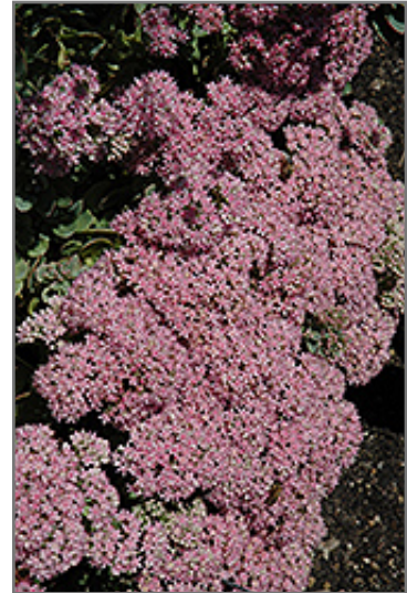
Lime Zinger Stonecrop flowers

This is a relatively low maintenance plant, and is best cleaned up in early spring before it resumes active growth for the season. It is a good choice for attracting bees and butterflies to your yard, but is not particularly attractive to deer who tend to leave it alone in favor of tastier treats. It has no significant negative characteristics.