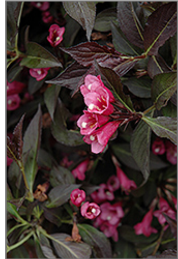
Spilled Wine Weigela flowers

Spilled Wine Weigela makes a fine choice for the outdoor landscape, but it is also well-suited for use in outdoor pots and containers. Because of its height, it is often used as a 'thriller' in the 'spiller-thriller-filler' container combination; plant it near the center of the pot, surrounded by smaller plants and those that spill over the edges. Note that when grown in a container, it may not perform exactly as indicated on the tag - this is to be expected. Also note that when growing plants in outdoor containers and baskets, they may require more frequent waterings than they would in the yard or garden.