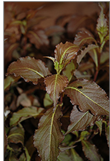
Spilled Wine Weigela foliage