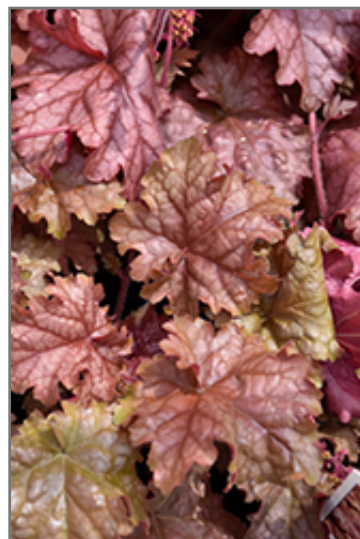
Carnival Peach Parfait Coral Bells foliage

Carnival Peach Parfait Coral Bells is recommended for the following landscape applications;