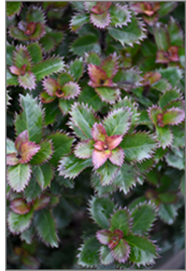
Scallywag Holly foliage