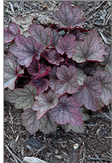
Carnival Rose Granita Coral Bells foliage

Carnival Rose Granita Coral Bells is recommended for the following landscape applications;