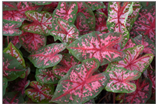
Carolyn Whorton Caladium foliage