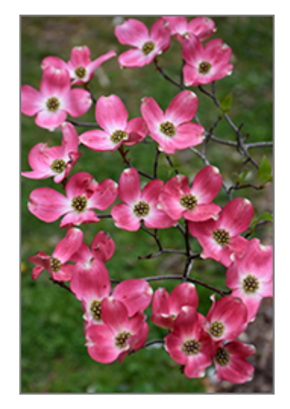
Red Flowering Dogwood flowers

Red Flowering Dogwood is a multi-stemmed deciduous tree with a stunning habit of growth which features almost oriental horizontally-tiered branches. Its average texture blends into the landscape, but can be balanced by one or two finer or coarser trees or shrubs for an effective composition.