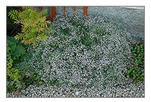
Common Baby's Breath in bloom