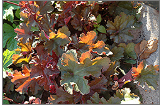
Chocolate Ruffles Coral Bells foliage

* This is a 'special order' plant - contact store for details