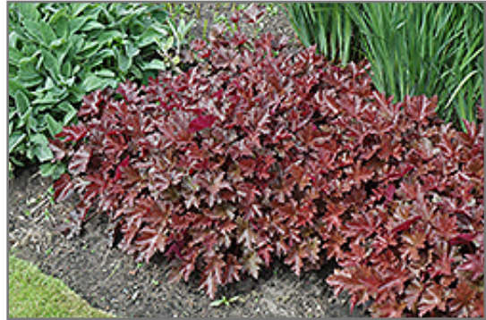
Chocolate Ruffles Coral Bells

This is a relatively low maintenance plant, and should be cut back in late fall in preparation for winter. It is a good choice for attracting hummingbirds to your yard. It has no significant negative characteristics.