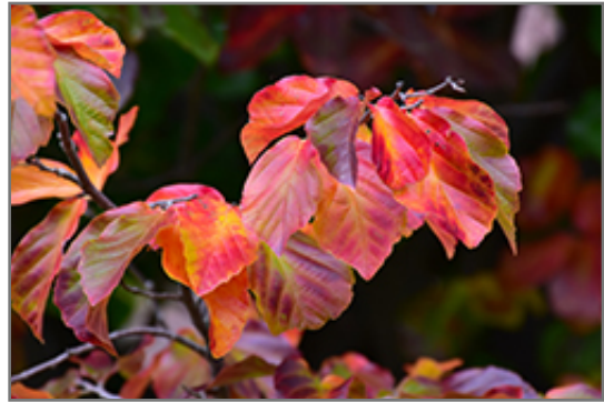
Persian Parrotia in fall