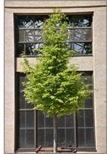
Persian Parrotia