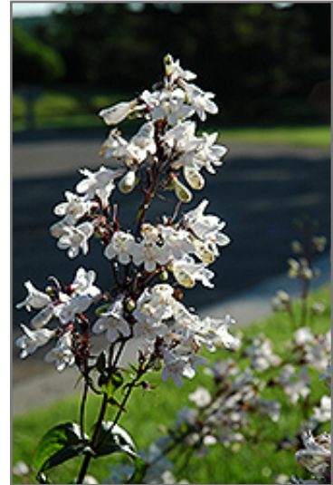
Husker Red Beard Tongue flowers