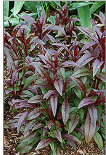
Husker Red Beard Tongue foliage