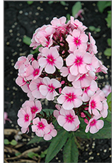
Bright Eyes Garden Phlox flowers

Bright Eyes Garden Phlox is a fine choice for the garden, but it is also a good selection for planting in outdoor pots and containers. With its upright habit of growth, it is best suited for use as a 'thriller' in the 'spiller-thriller-filler' container combination; plant it near the center of the pot, surrounded by smaller plants and those that spill over the edges. It is even sizeable enough that it can be grown alone in a suitable container. Note that when growing plants in outdoor containers and baskets, they may require more frequent waterings than they would in the yard or garden.