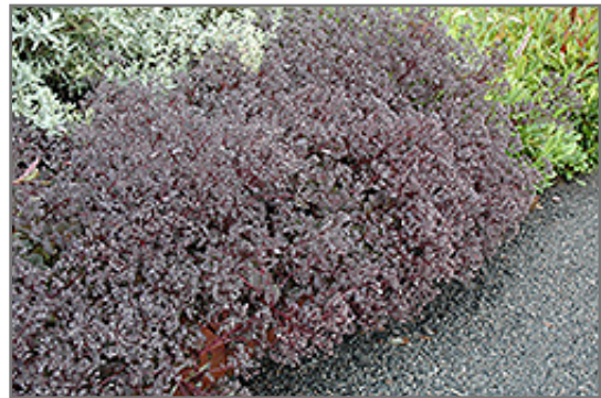
Bertram Anderson Stonecrop