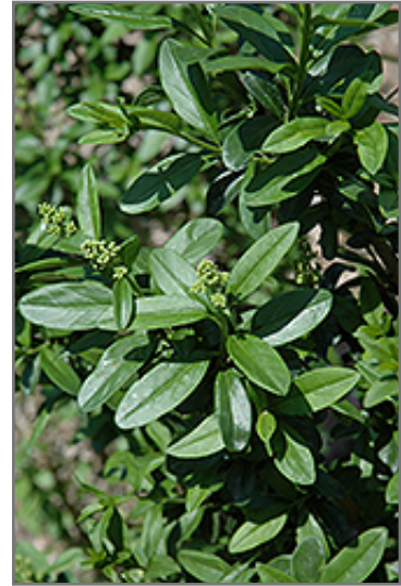
California Privet foliage