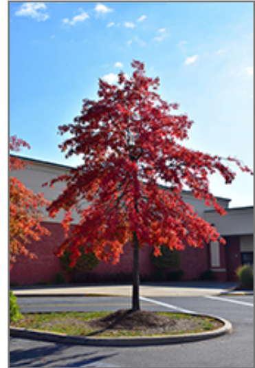
Pin Oak in fall