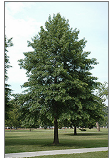
Pin Oak