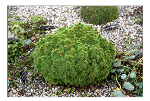
Alberta Globe Spruce