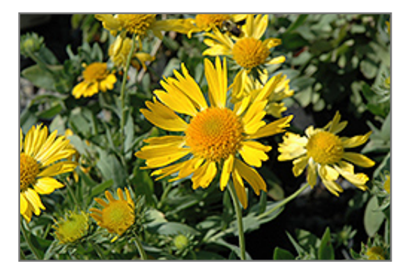
Sunburst Yellow Blanket Flower flowers