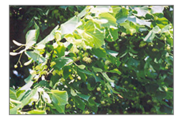
Littleleaf Linden flowers