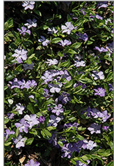
Common Periwinkle in bloom