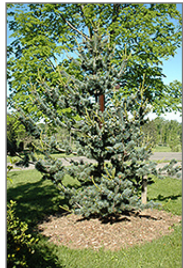
Short-Needled Japanese Blue Pine