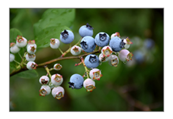
Highbush Blueberry fruit

This is a multi-stemmed deciduous shrub with an upright spreading habit of growth. Its average texture blends into the landscape, but can be balanced by one or two finer or coarser trees or shrubs for an effective composition. This is a relatively low maintenance plant, and usually looks its best without pruning, although it will tolerate pruning. It is a good choice for attracting birds to your yard. It has no significant negative characteristics.