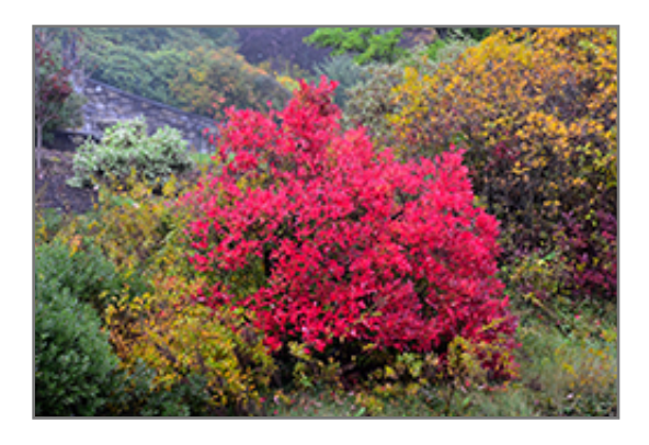
Highbush Blueberry in fall