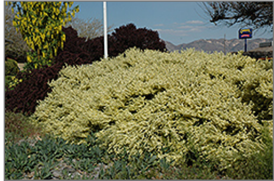
Moonlight Scotch Broom in bloom