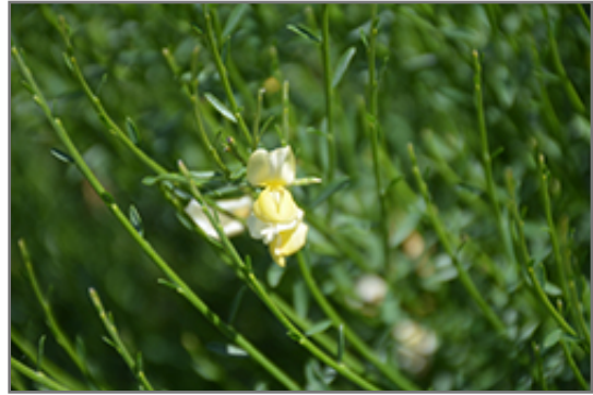
Moonlight Scotch Broom flowers

This shrub should only be grown in full sunlight. It prefers dry to average moisture levels with very well-drained soil, and will often die in standing water. It is considered to be drought-tolerant, and thus makes an ideal choice for xeriscaping or the moisture-conserving landscape. It is particular about its soil conditions, with a strong preference for clay, alkaline soils, and is able to handle environmental salt. It is highly tolerant of urban pollution and will even thrive in inner city environments. This is a selected variety of a species not originally from North America.